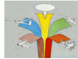
AeC Milano Est